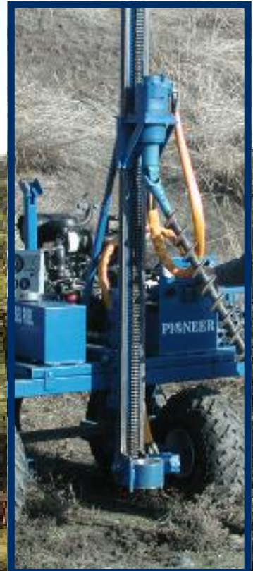
Specialty & Multi-Purpose