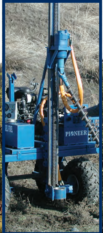
Specialty & Multi-Purpose